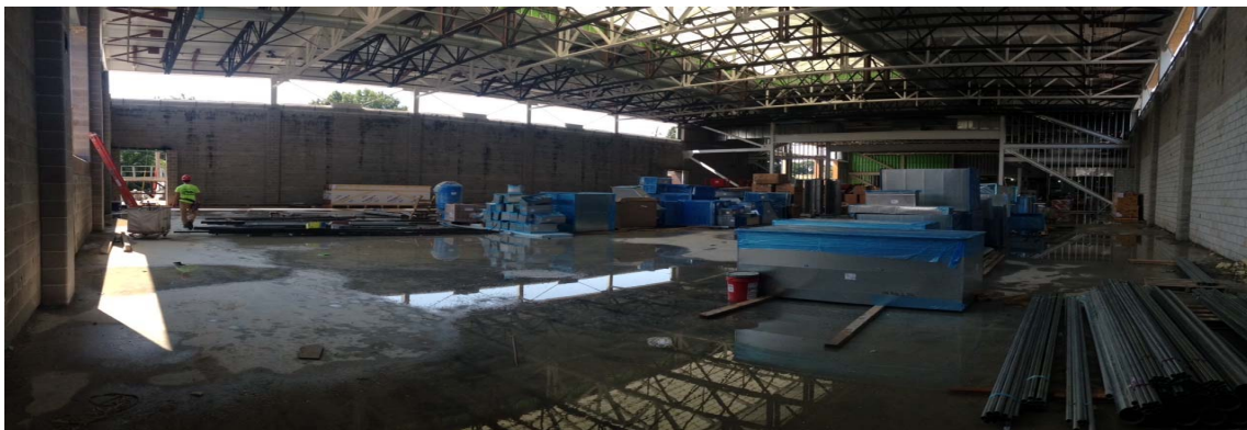
Status of Exterior Construction and Gym Skylight