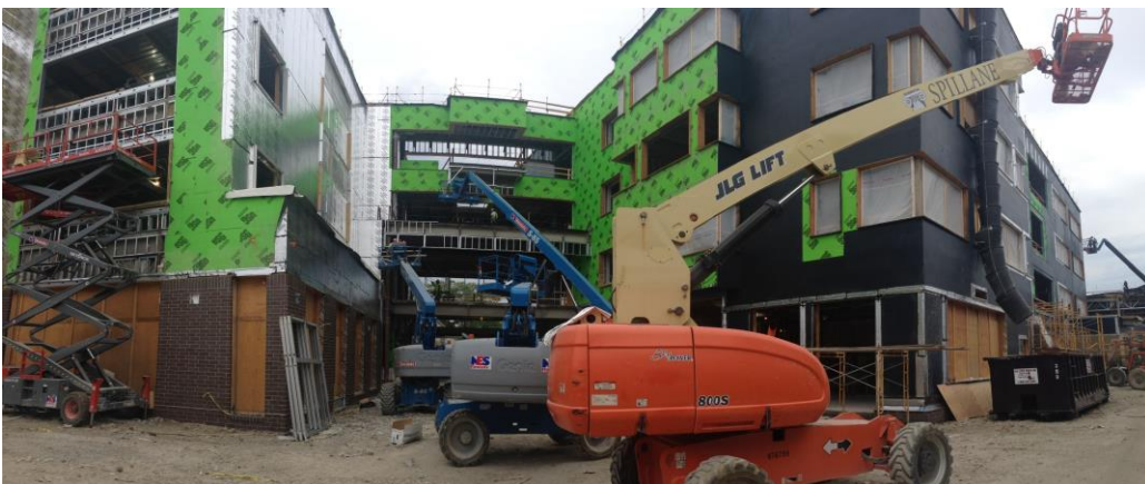
Status of Exterior and Interior Construction